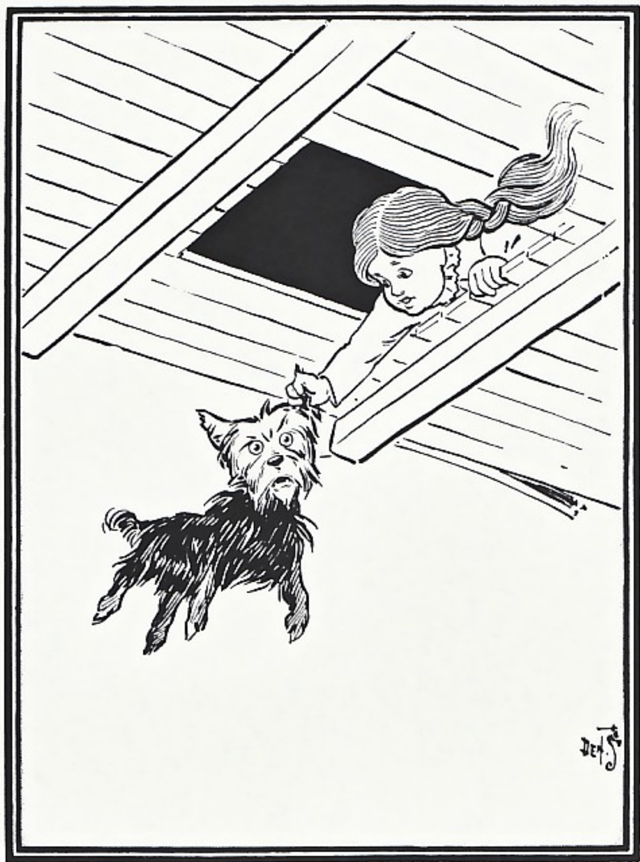
She caught Toto by the ear.