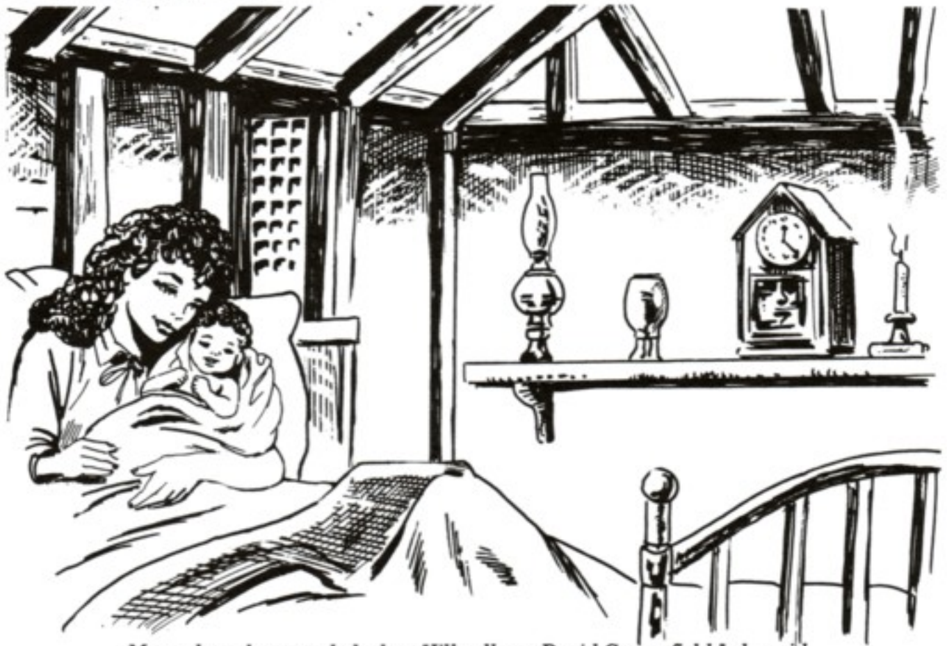
Mama hugs her new, baby boy. "I'll call you David Copperfield," she said.