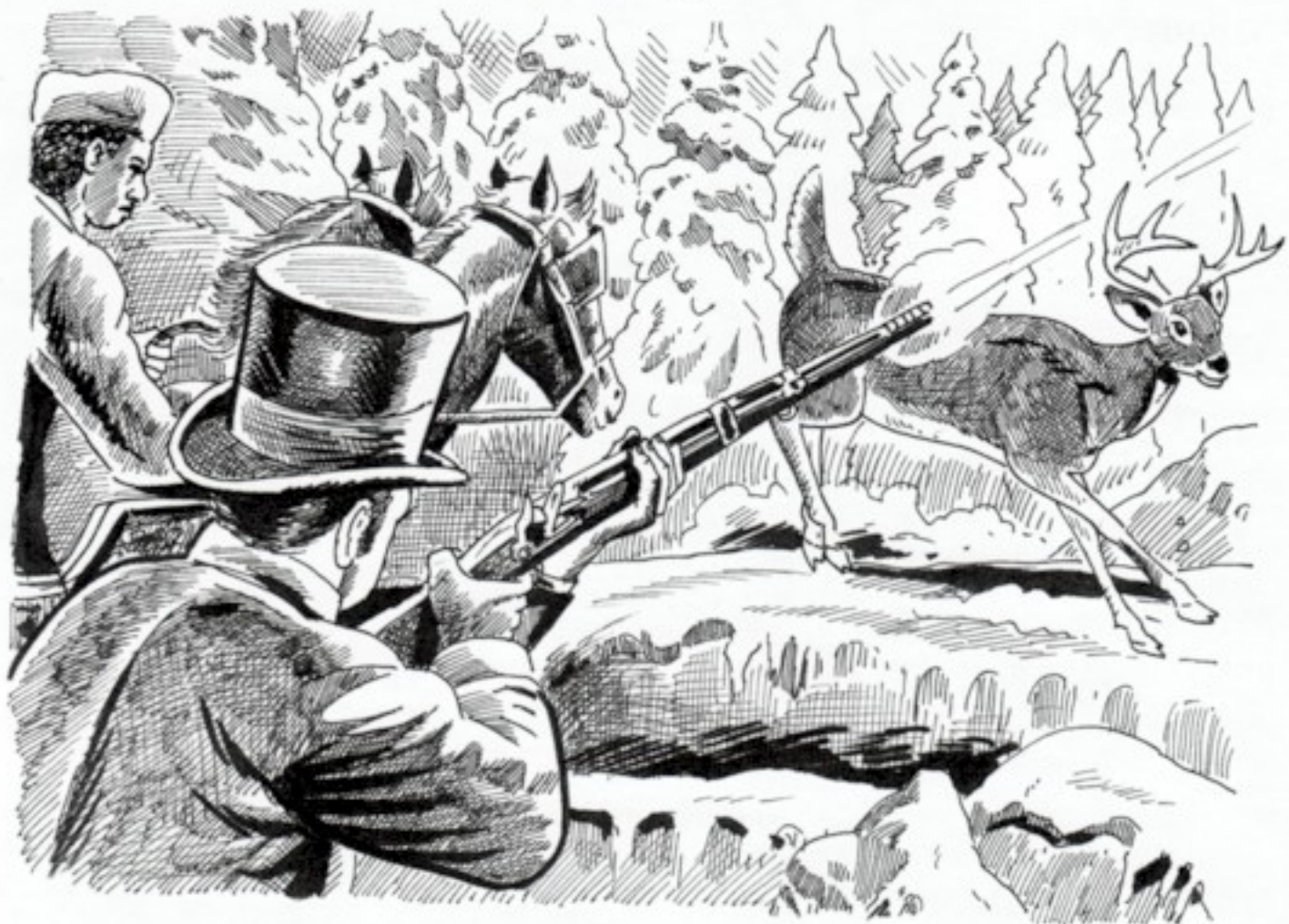
Judge Temple fires his rifle at a buck.