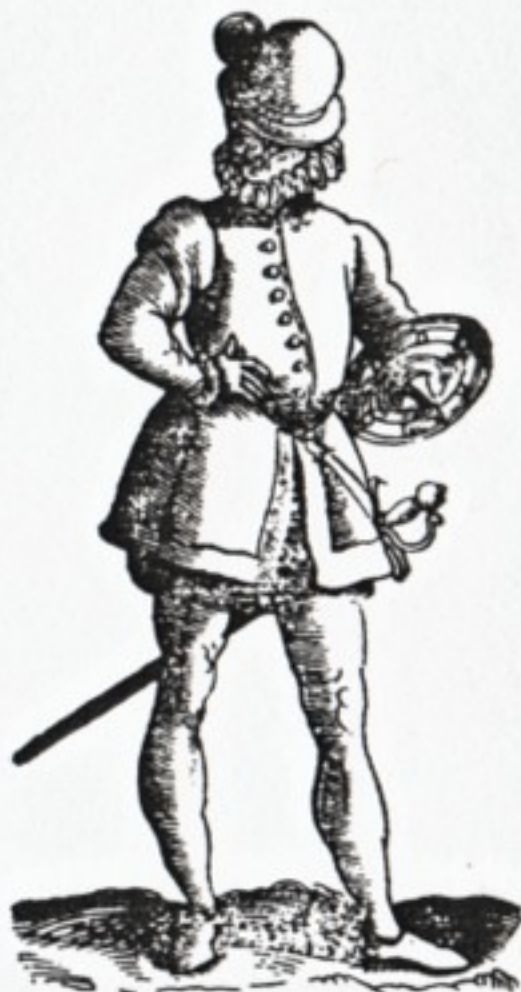
A gentleman with sword and buckler. (1.1.0 SD) From Cesare Vecellio, Habiti antichi et moderni (1598).