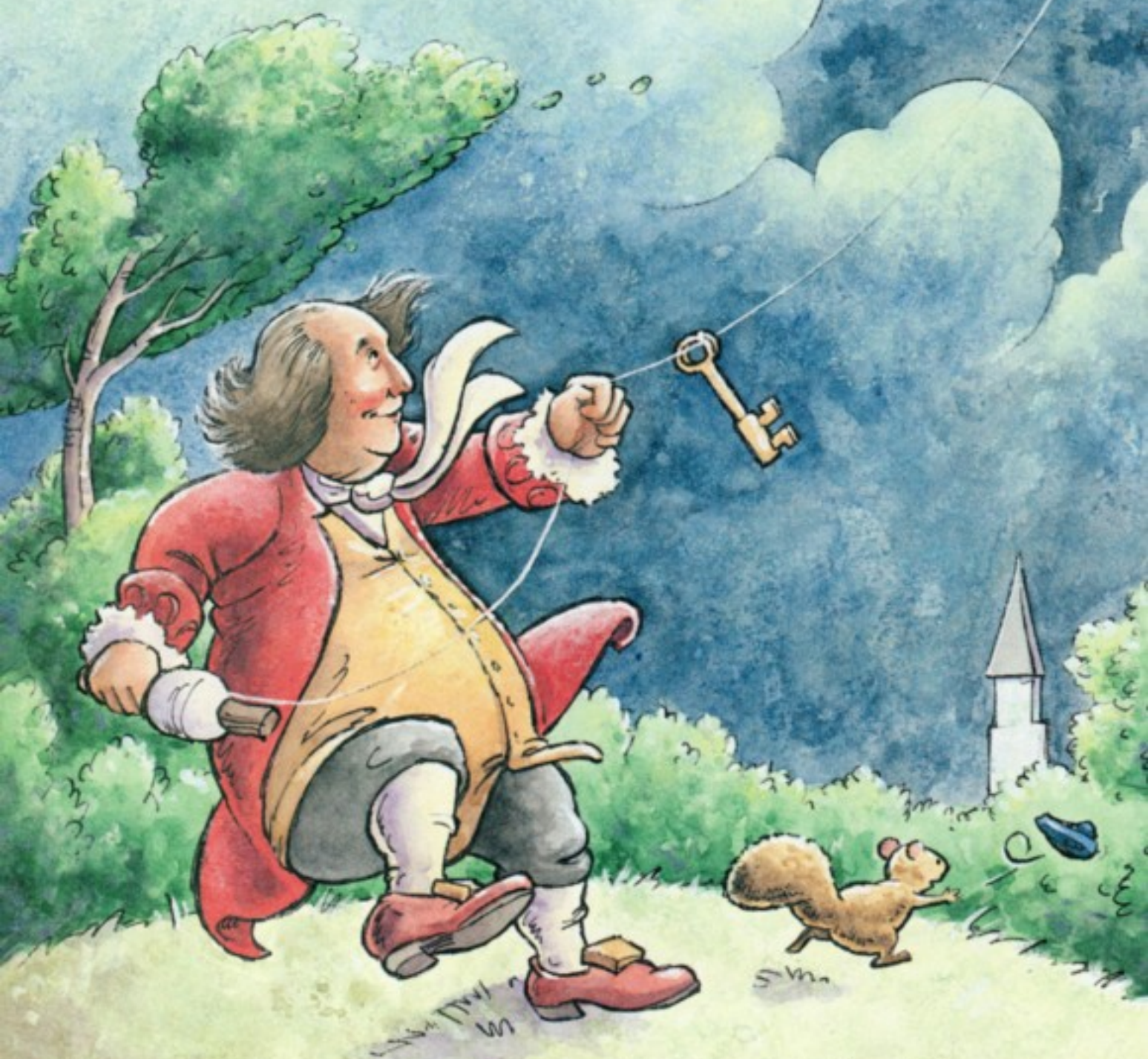
Experiments with electricity, 1752

This was not a safe thing to do. But Ben did find out that lightning was made of electricity.