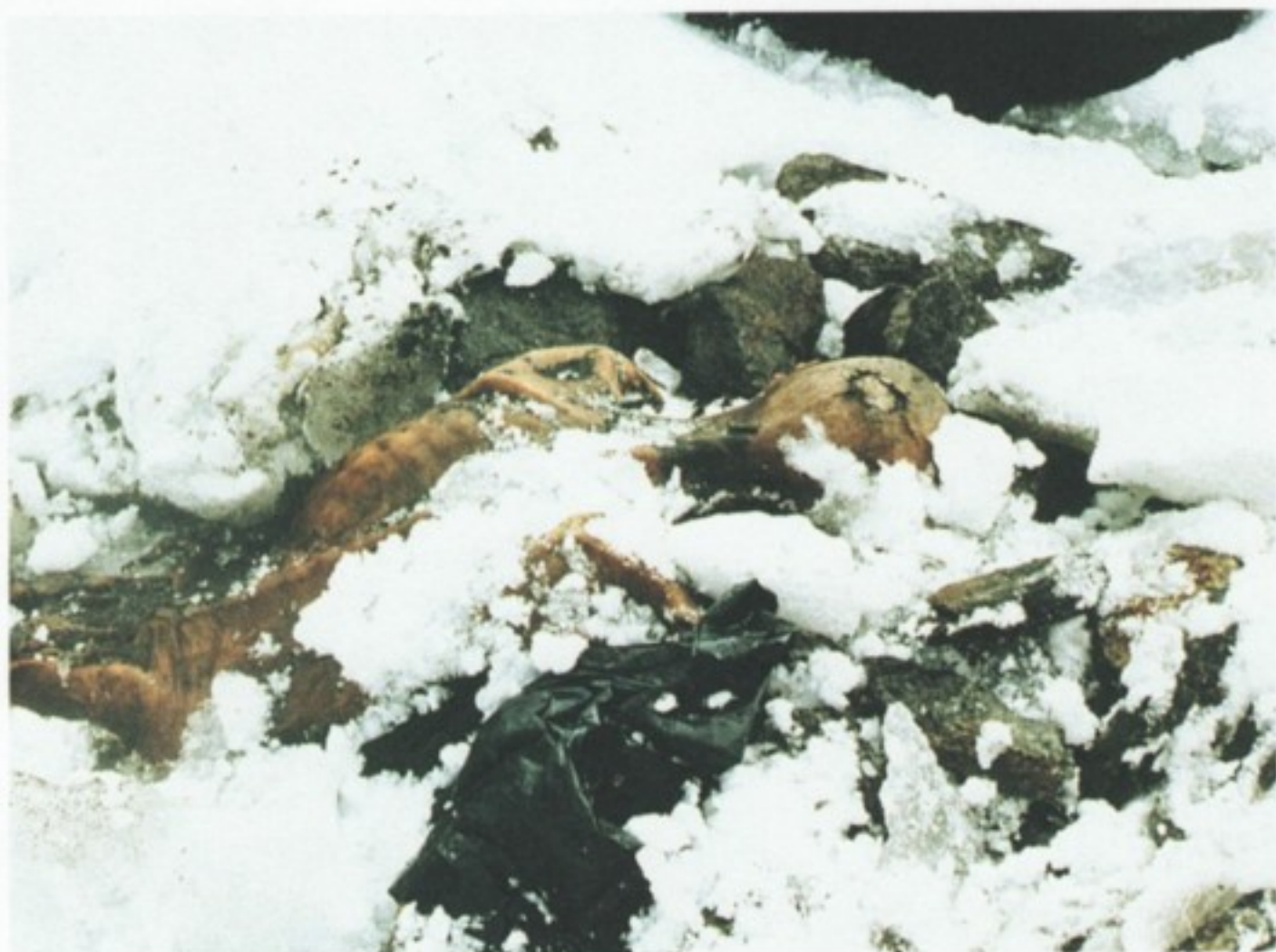
The Ice Mummy, as he was found.

Quickly they take a photograph of the body. Then they hurry to the next hikers’