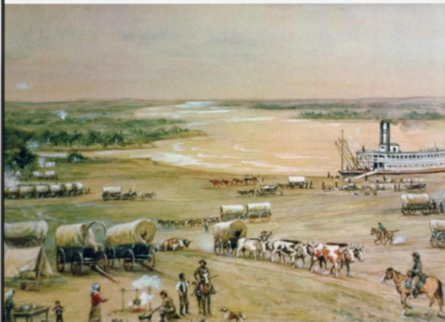
Wagons gathering in Independence, Missouri

Today, we reached our “jumping off” point— Independence, Missouri. We bought last-minute wagon supplies here and met up with others heading west.