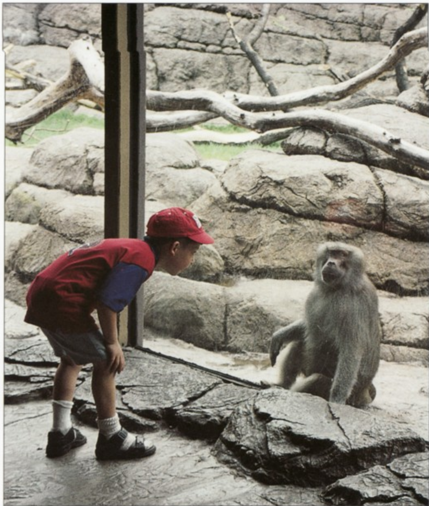
A hamadras baboon at the Bronx Zoo in New York, New York