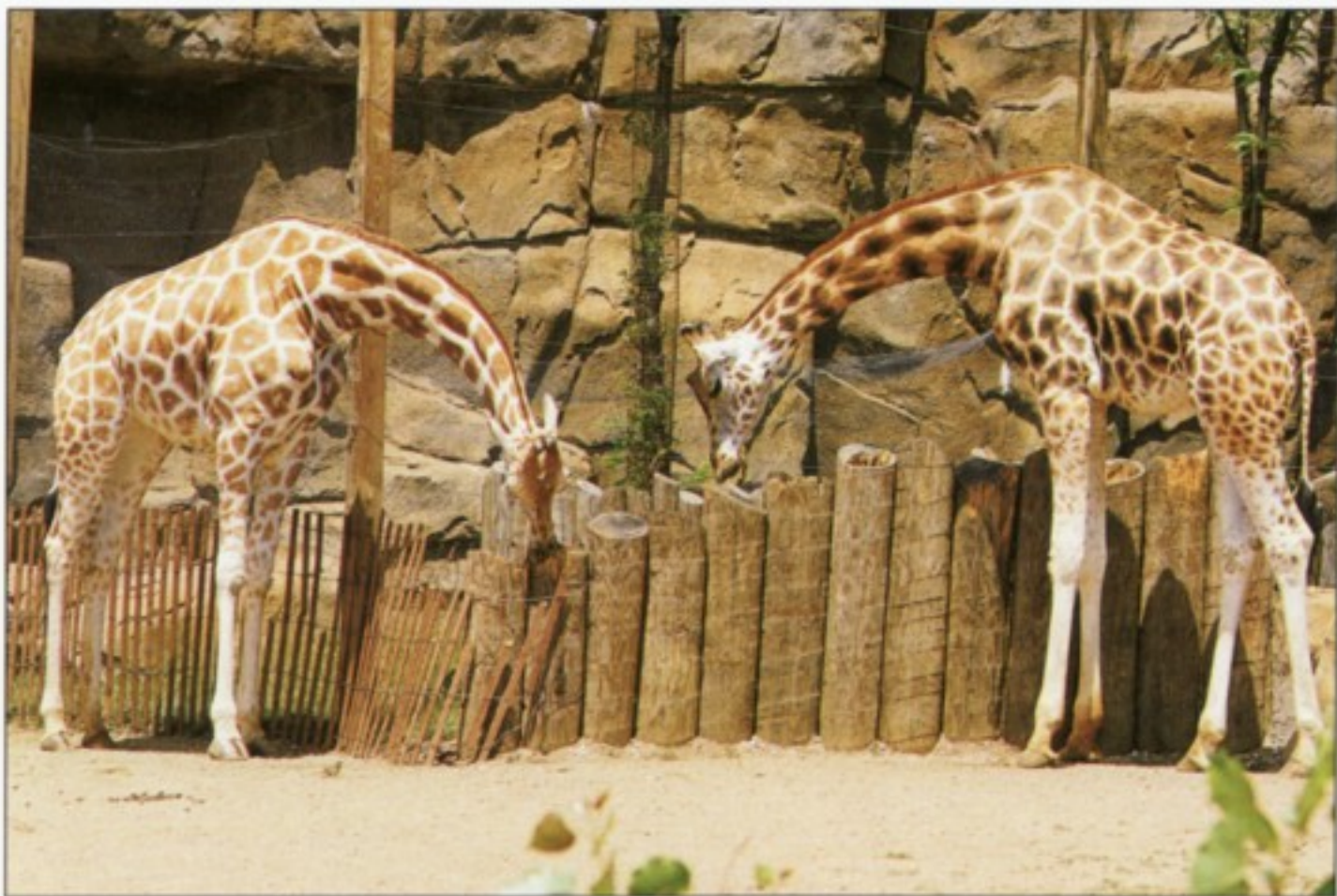
Giraffes at Lincoln Park Zoo in Chicago, Illinois

Why is a zoo called a zoo? Zoo is short for zoological (zoh-oh-LA-ji-kal), which means “having to do with animals.”