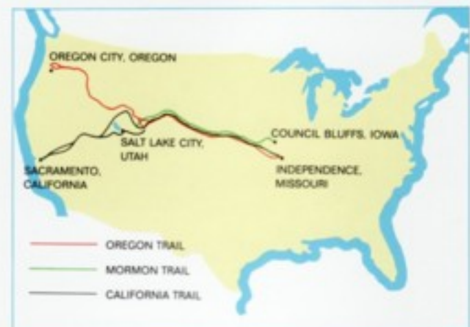
Above: The Three Main Trails West

people went out to explore the region and came back with reports of rich soil and good opportunities for farmers. Interest in the west grew, until it was said that "if hell were in the west, Americans would cross heaven to get there." Newspaper editors spoke of the "Manifest Destiny" to make the United States stretch "from sea to shining sea." "Oregon Fever" was just one part of this western expansion. According to the "boosters" who encouraged people to move west, Oregon was a paradise "flowing with milk and honey." It was even said that pigs ran around ready cooked with knives and forks sticking in them so that anyone could have a slice.