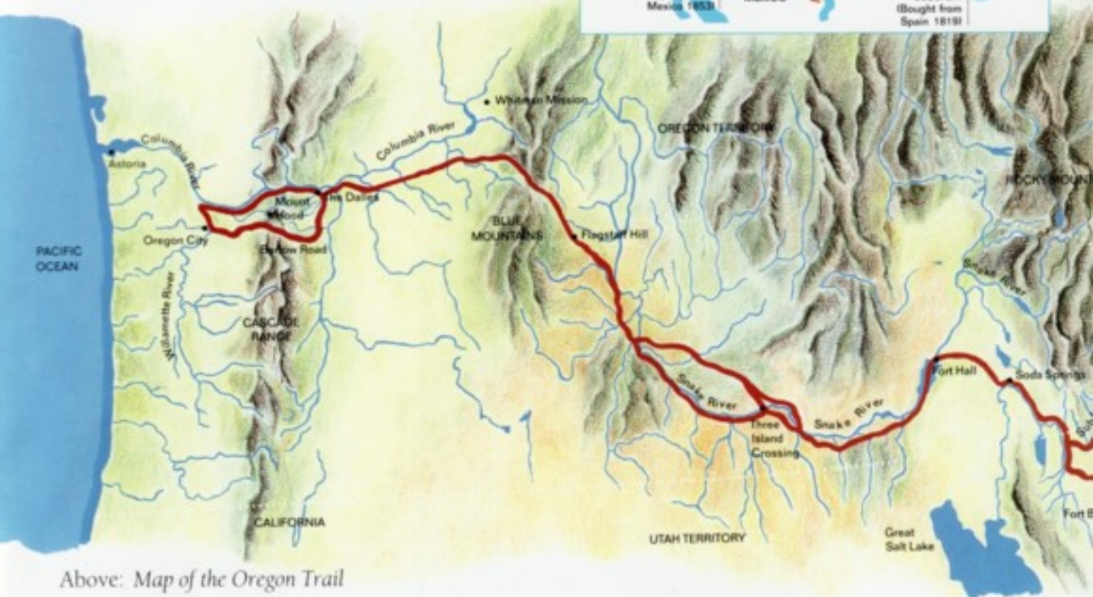
Above: Map of the Oregon Trail

people went out to explore the region and came back with reports of rich soil and good opportunities for farmers. Interest in the west grew, until it was said that "if hell were in the west, Americans would cross heaven to get there." Newspaper editors spoke of the "Manifest Destiny" to make the United States stretch "from sea to shining sea." "Oregon Fever" was just one part of this western expansion. According to the "boosters" who encouraged people to move west, Oregon was a paradise "flowing with milk and honey." It was even said that pigs ran around ready cooked with knives and forks sticking in them so that anyone could have a slice.