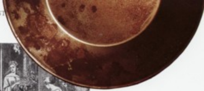
Above: A gold pan.