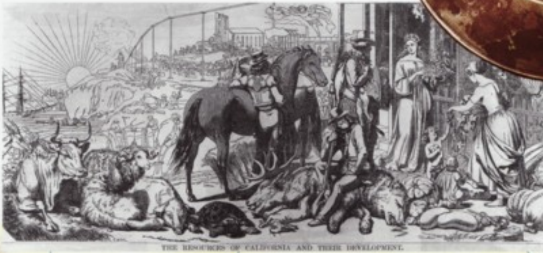
Left: A "boosterist" poster showing California as a paradise.